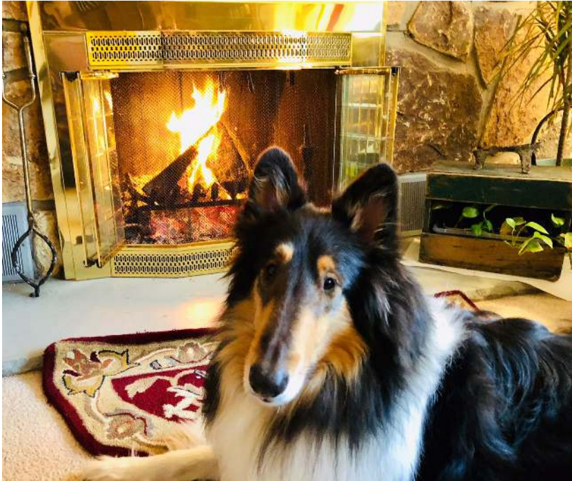
On these cold winter days cozy up to a warm fire like Carl's dog Isla.